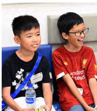
Even our teachers were smiling from ear to ear!