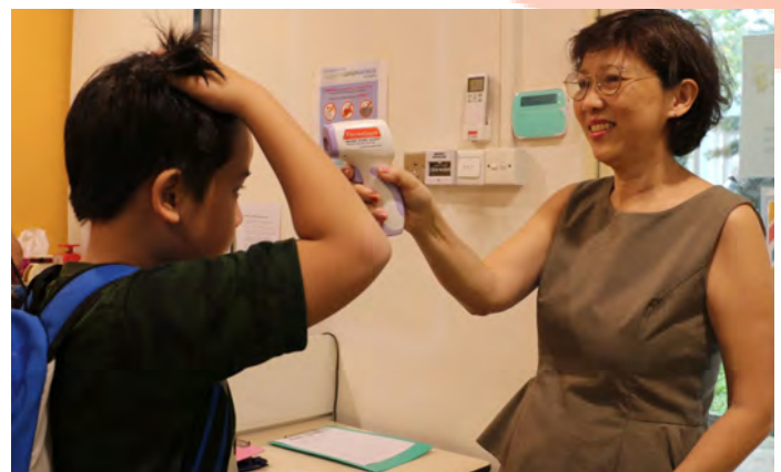
Our staff conducting temperature checks to ensure the safety and health of everyone in the literacy centre!

being are looked after. Epworth will remain vigilant in our operations through this period of time. We will diligently continue with the relevant precautionary practices, even when the alert level is reduced.