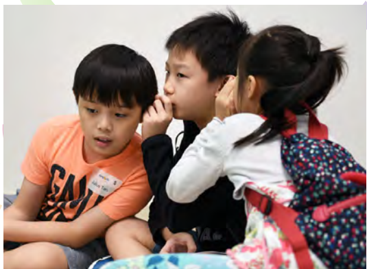
Trying their best to pass the message accurately.