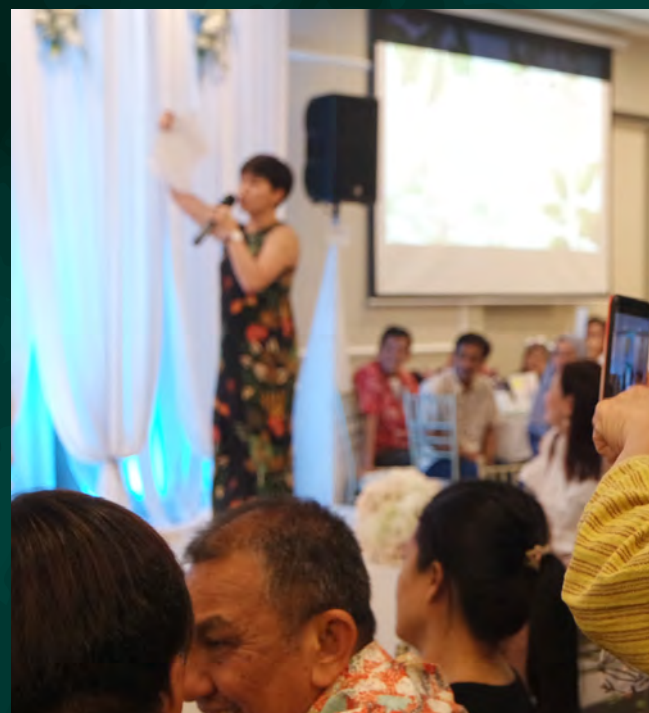
Parents, partners and staff alike were enjoying the impressive performance.