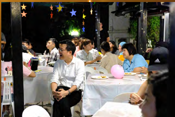
Our guests enjoying the splendid performance put up by our residents.

While the guests were settling down for dinner, an appreciation video was screened to show a glimpse of what life was like for the residents in Epworth HSH. There were many joyful and emotional moments from the video which our guests thoroughly enjoyed.