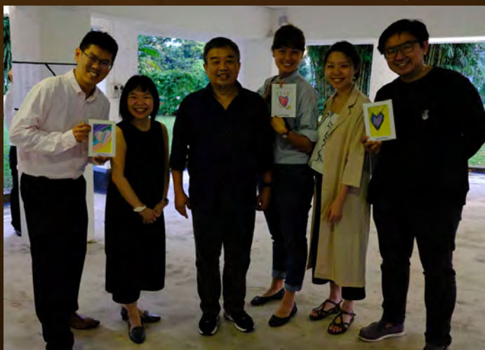
Our Executive Director, Head of Home and partners posing together with their beautiful gifts.

It was indeed a successful event! Although it was challenging for the residents to juggle different commitments simultaneously, we were proud that they managed to pull it off and even delivered such an impressive performance.