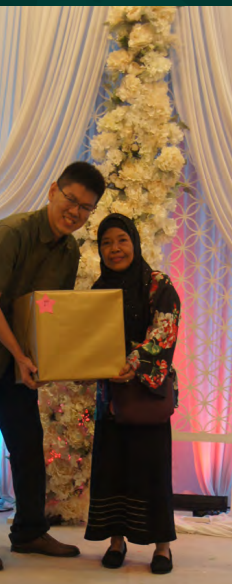
Our social worker enjoyed a talk with foster families.