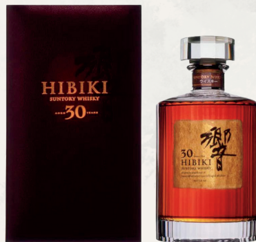
SUNTORY WHISKY HIBIKI 30 YEARS OLD