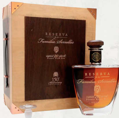
DON Q RESERVA DE LA FAMILIA SERRALLES 20-YEAR-OLD RUM FROM PUERTO RICO