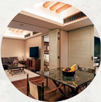
LUXURIOUS 5-STAR GETAWAY AT THE BARRACKS HOTEL SENTOSA – SUITE ROOM (79 SQM) (2 SETS) MV: $1,200/NIGHT