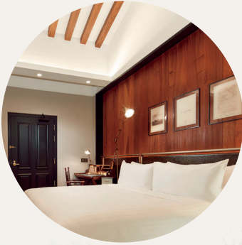
REJUVENATING 5-STAR GETAWAY AT THE BARRACKS HOTEL SENTOSA – PREMIER ROOM (39 SQM) (2 SETS) MV: $750/NIGHT