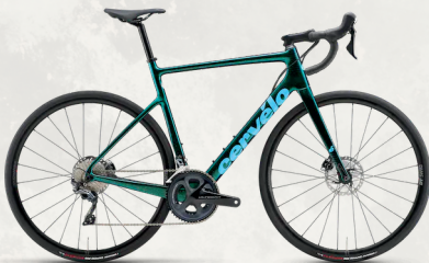
CERVELO CALEDONIA 105 ENDURANCE BIKE COLOR: OASIS SIZE OPTION: 48/51/54/56/58 MV: $4,990