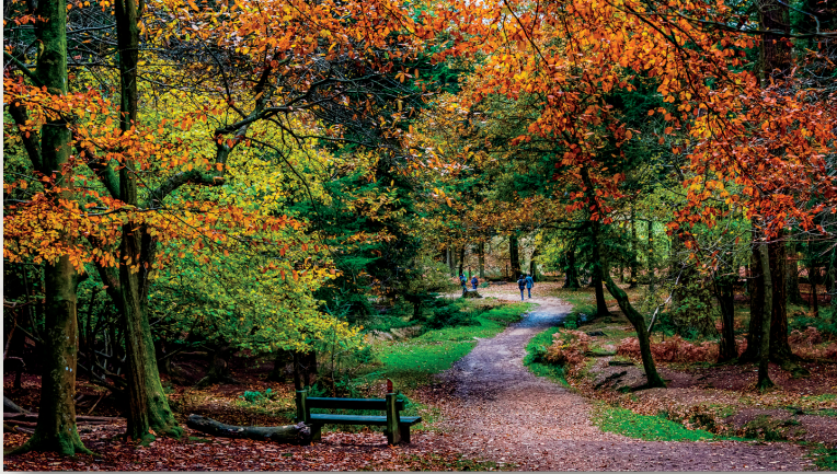
‘AUTUMN IN HAMPSHIRE’ 36 X 24 INCHES

THIS PHOTOGRAPHIC WORK IS A GIFT TO EPWORTH COMMUNITY SERVICES FROM MR TAN CHUAN-JIN, SPEAKER OF PARLIAMENT