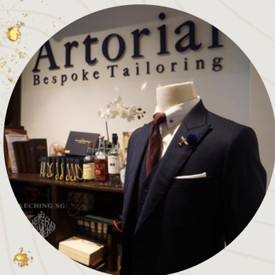
Made-To-Measure Suit from Artorial Bespoke Tailoring MV: $2,000 SB: $1,600