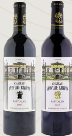
Chateau Leoville Barton St-Julien 2003 & 2006 Total MV: $500 Total SB: $400