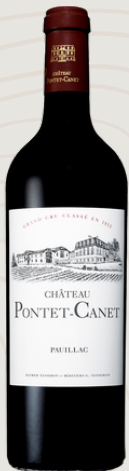
Pontet Canet 2010 Magnum (1.5L) MV: $500 SB: $400