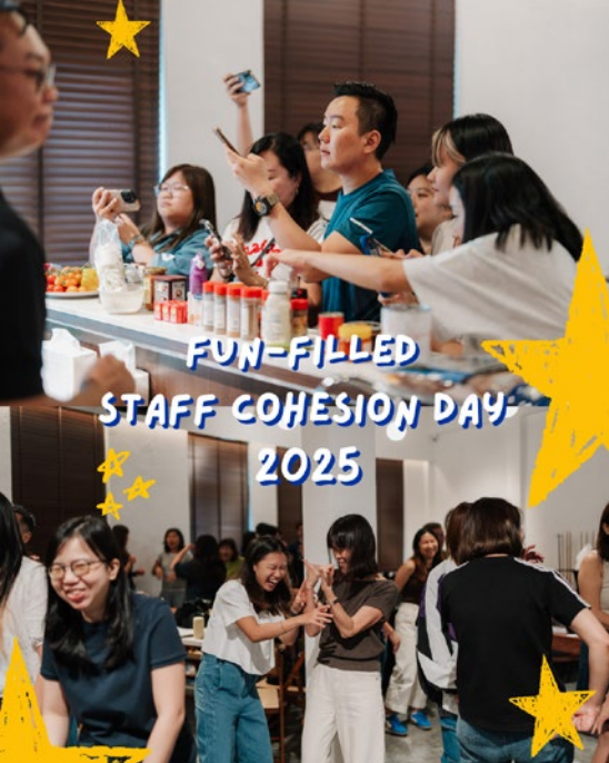
FUN-FILLED STAFF COHESION DAY 2025