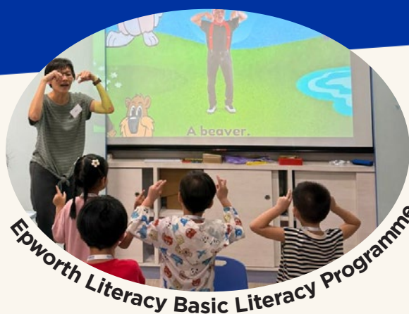
Epworth Literacy Basic Literacy Programme