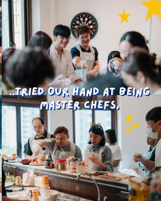
...TRIED OUR HAND AT BEING MASTER CHEFS,