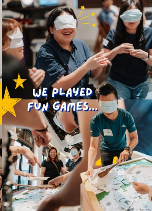
WE PLAYED FUN GAMES...