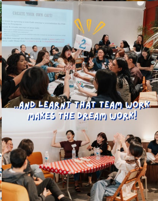
...AND LEARNT THAT TEAM WORK MAKES THE DREAM WORK!