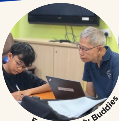
Epworth Study Buddies