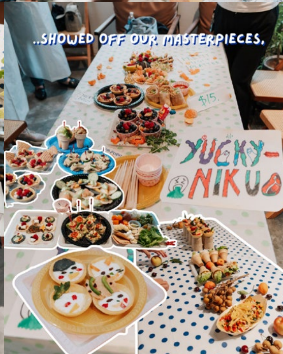
...SHOWED OFF OUR MASTERPIECES.